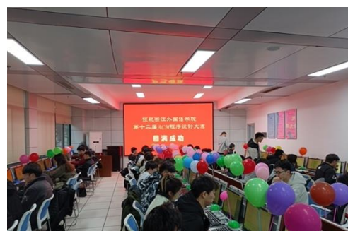
ACM competition scene